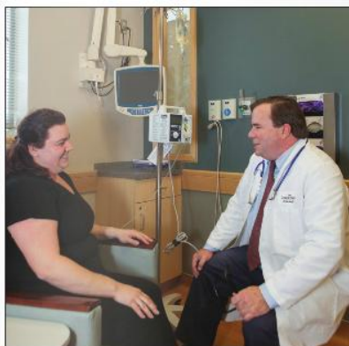
The state-of-the-art Cancer Center at Harrington offers comprehensive cancer care under one roof. Services include hematology and oncology/infusion, radiation therapy, and patient support, such as access to a social worker, genetic counseling, and a lymphedema clinic.